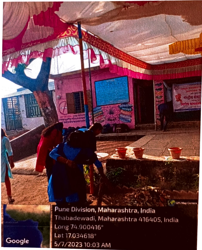
Primary School Campus Cleaning